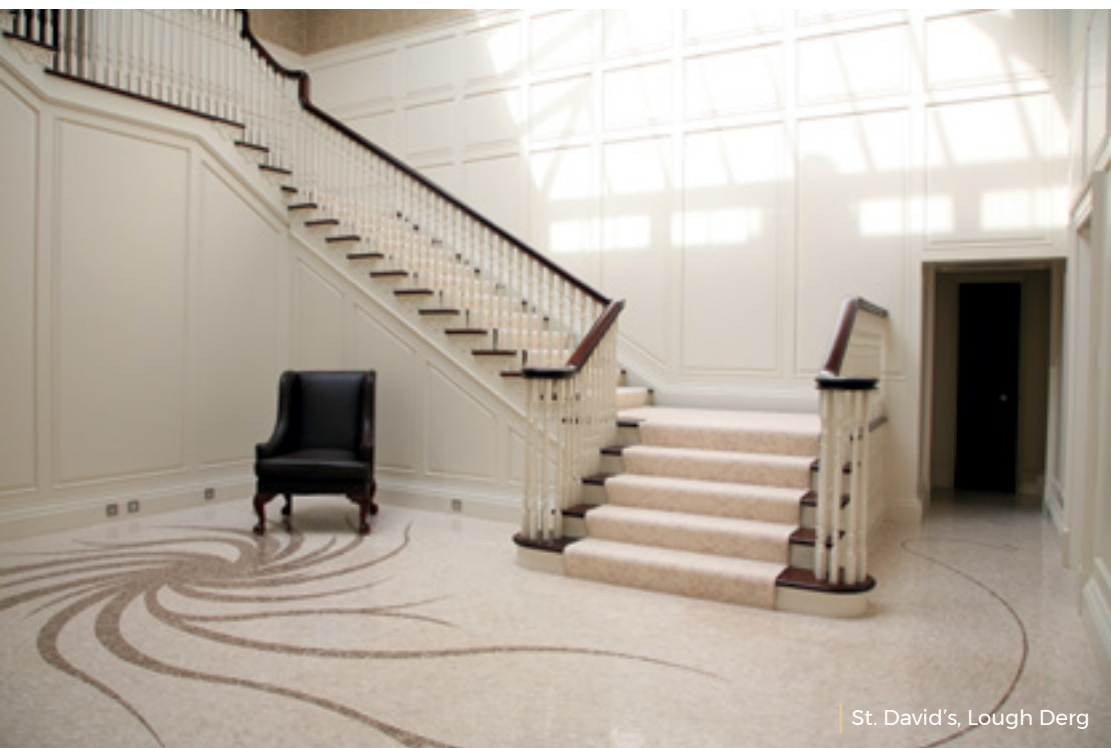
St. David's, Lough Derg