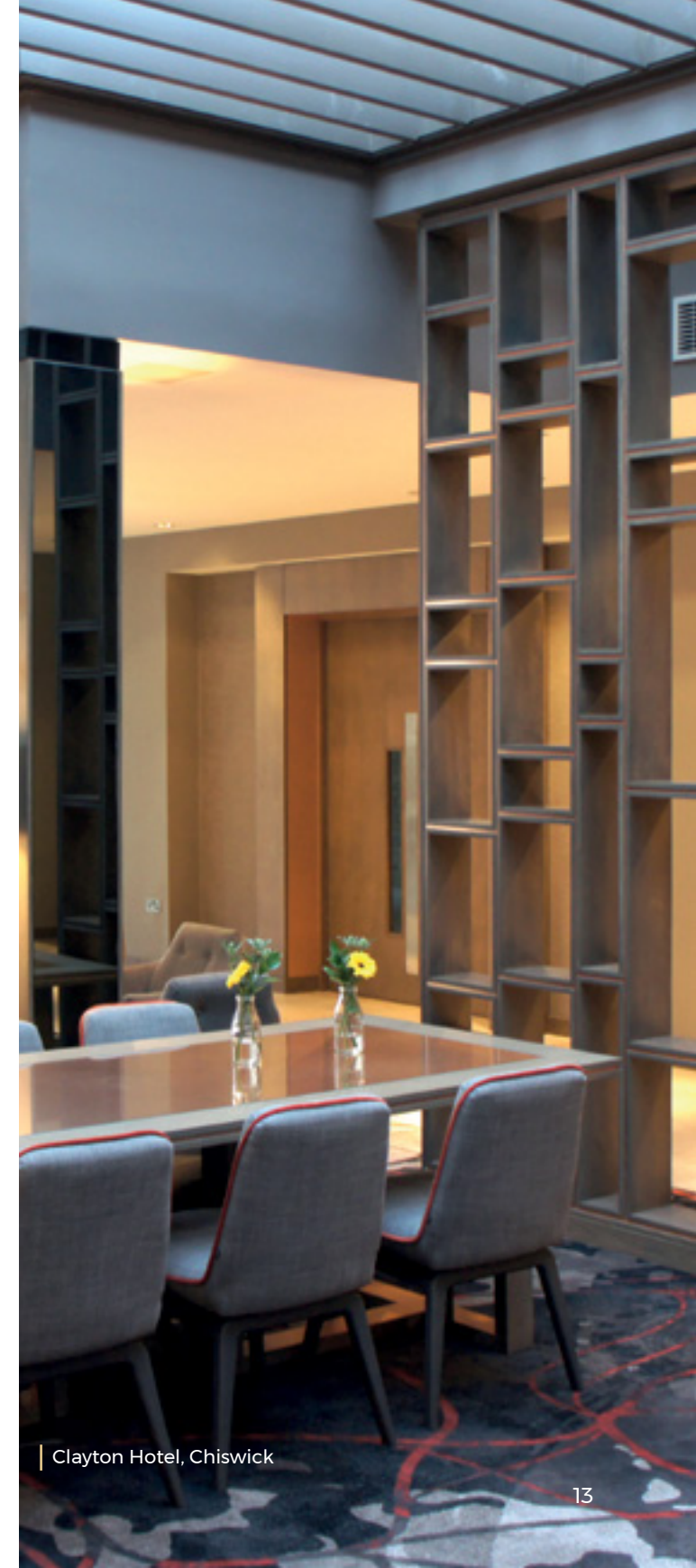
| Clayton Hotel, Chiswick