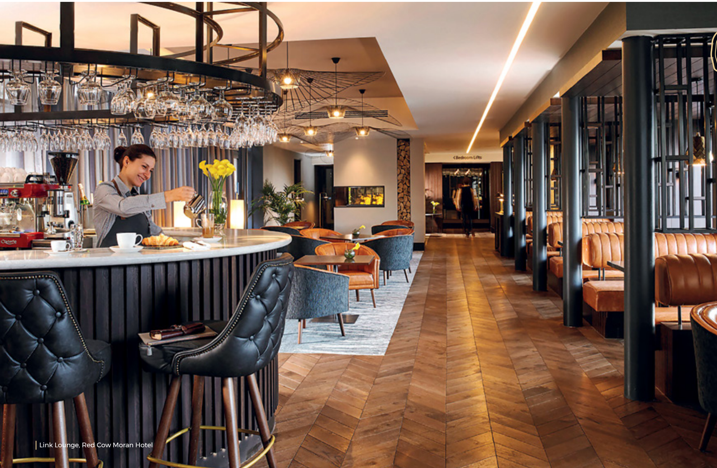
| Link Lounge, Red Cow Moran Hotel