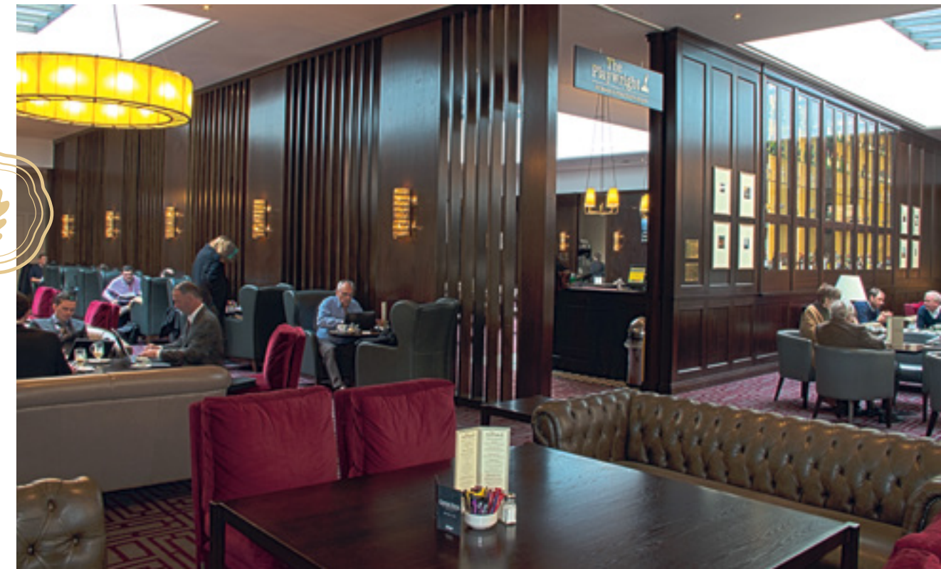
| Clayton Hotel, Dublin Airport

A senior contact is provided to all customers, they will always answer and return your calls.