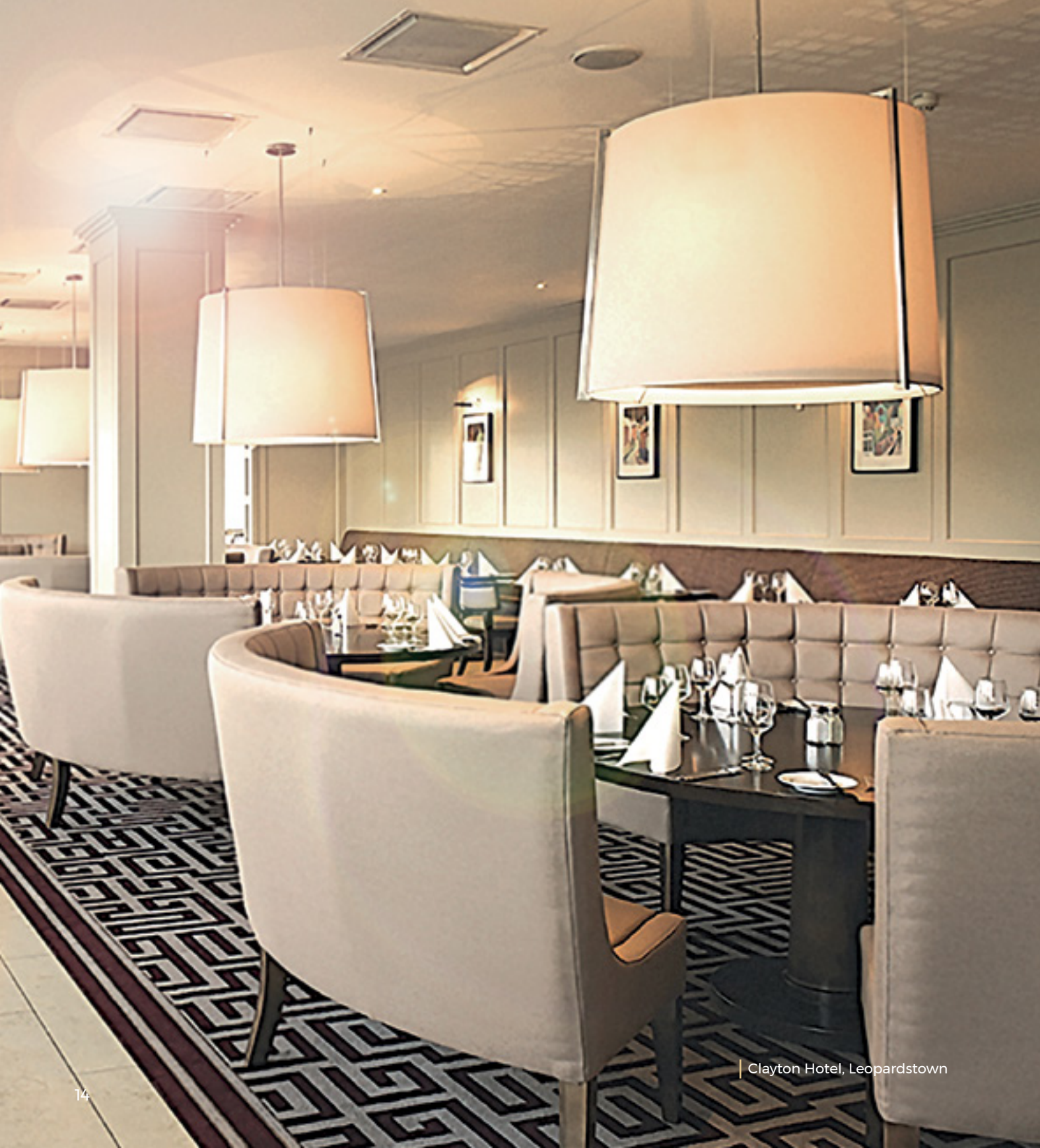
| Clayton Hotel, Leopardstown