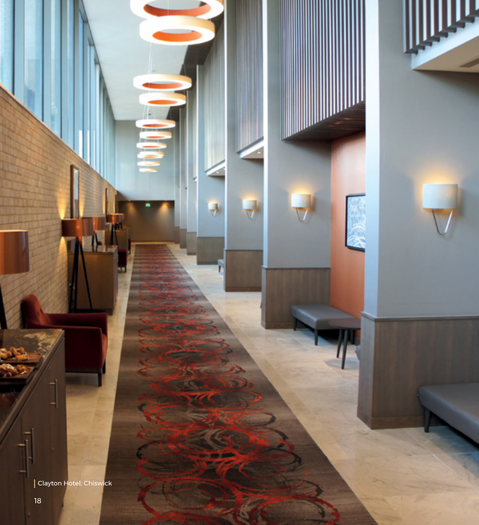
| Clayton Hotel, Chiswick

Standards are high for your expectations and our workmanship.