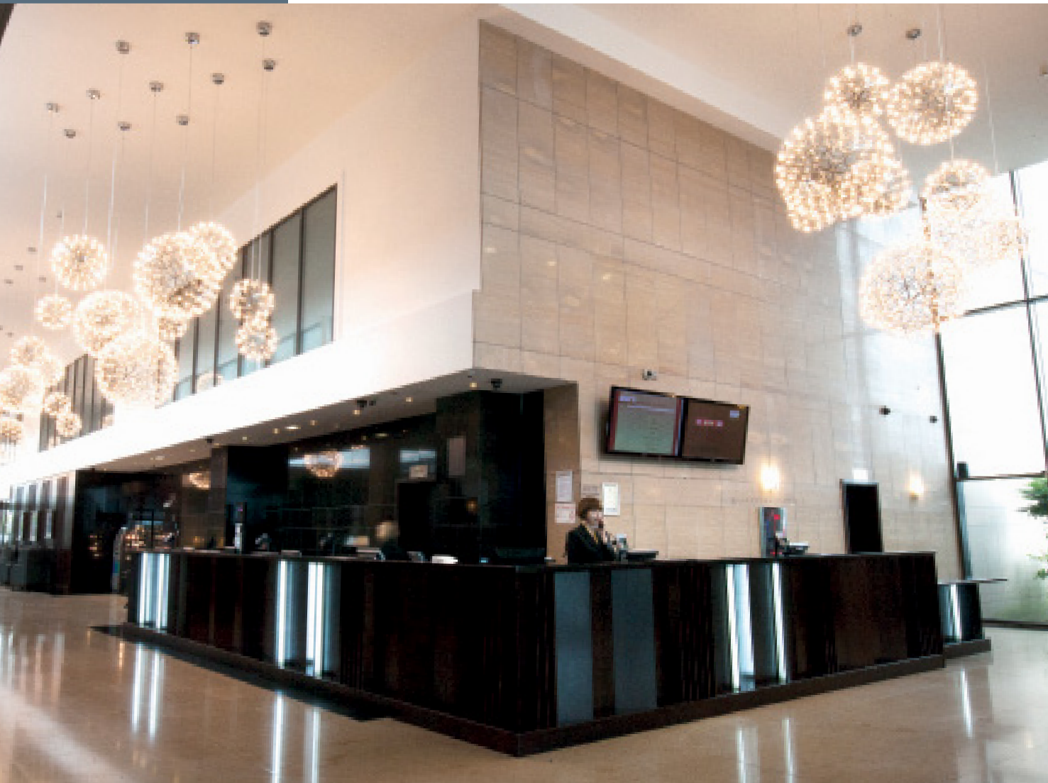
| Clayton Hotel Reception Area, Dublin Airport