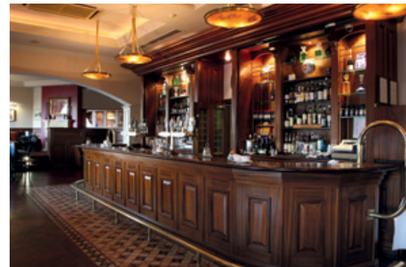
| Red Cow Moran Hotel, Dublin