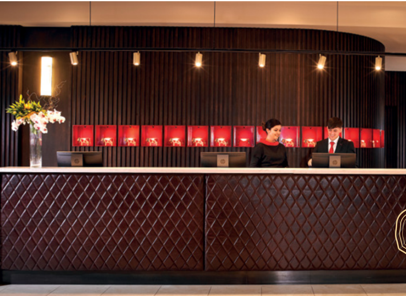
Red Cow Moran Hotel, Dublin