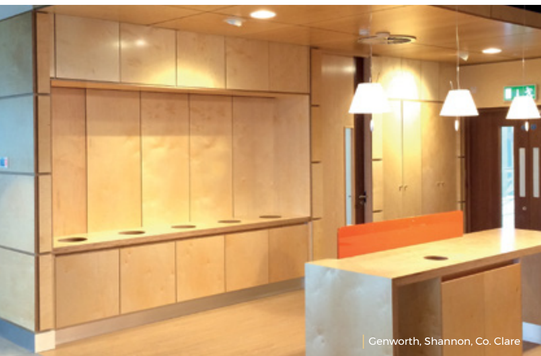
Genworth, Shannon, Co. Clare