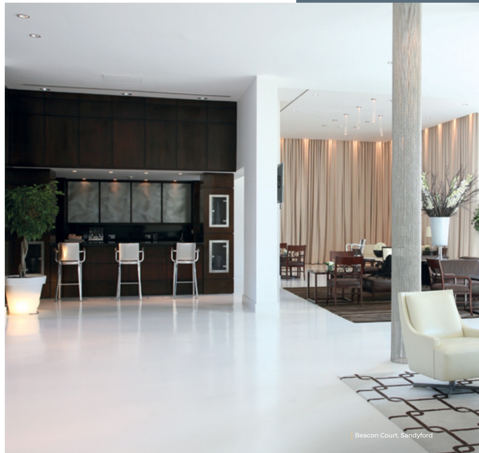
Beacon Court, Sandyford