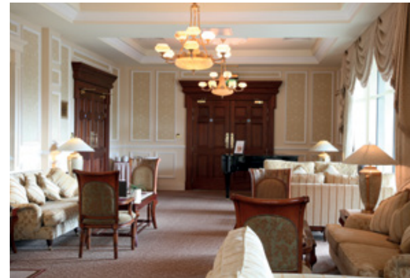
| The Heritage Hotel and Golf Resort, Killenard